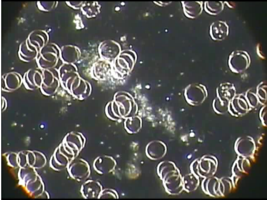
Parasitized unhealthy blood cells in dirty plasma, before ozone treatment.

Your good health is dependent upon healthy blood. If you have clean well oxygenated blood this will be reflected in your overall well-being.